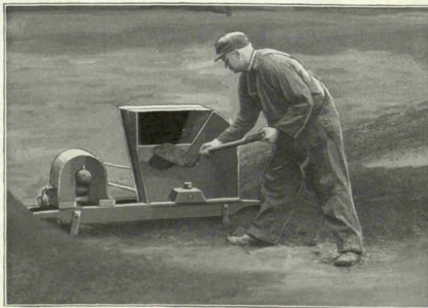
BEARDSLEY AND PIPER NEW COMPOST MACHINE

The new Soilspreader Top Soil dresser is also of simple construction and low in cost—it is for use in spreading top soil dressings on greens and turf. Special features include adjustments for light or heavy feed of top soil, even distribution of material and wheel clutches that make for positive discharge of top dressing only when and where wanted.