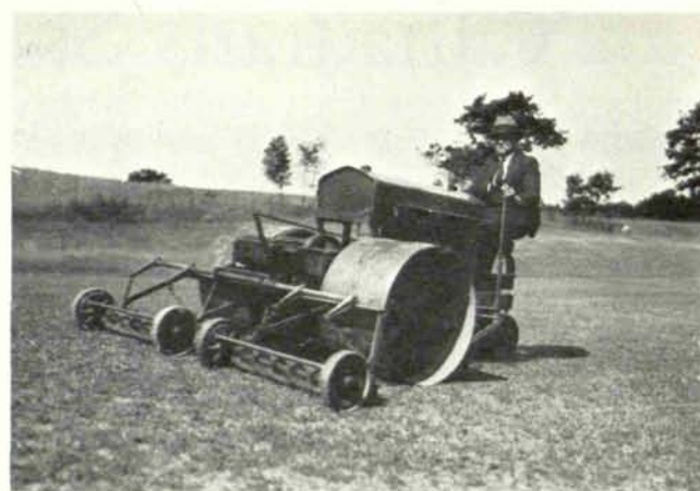
IDEAL TRIPLEX EXHIBITED BY THE AIKENHEAD CO., TORONTO

The policies of Quebec and Ontario greenkeepers are different. Efforts in Quebec consist of cooperative purchases and assistance to the local greenkeeper when he requires it given by an experienced official. In Ontario, success has attended the in-