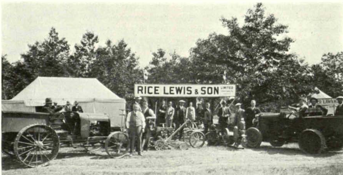
RICE LEWIS & SON, LTD., HAD ONE OF THE LARGEST EXHIBITS AT THE ROYAL YORK EXHIBITION At the right is a Pennsylvania 6-cylinder tractor. On the left is the Staude tractor. Both are popular in Canada.

There was only one discordant note to be heard during the day. The gathering included national representatives of United States firms marketing their products in Canada, of Canadian firms, club secretaries who were seeking ideas as to how they