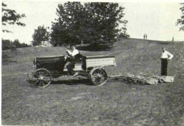
ROSEMAN TRACTOR AND MOWERS EXHIBITED BY EDWARD TIPPET, TORONTO