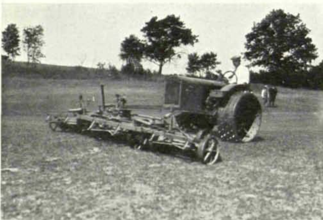
TORO UNIT EXHIBITED BY GOLF LIMITED, TORONTO

The morning was devoted to a demonstration of sprinklers, a demonstration of motor-driven compost mixers and screens, top dressing machines, spike rollers, putting green rollers, fertilizer and hand power sprayers. The afternoon was given over to a demonstration of tractors and fairway cutting units, power green machines, putting green