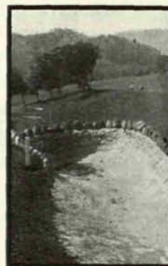
ORINDA — Oakland Calif., is a great course. It is ARMCO drained.

THE longer playing season on a properly drained and conditioned course means a better-satisfied membership and a more successful club.