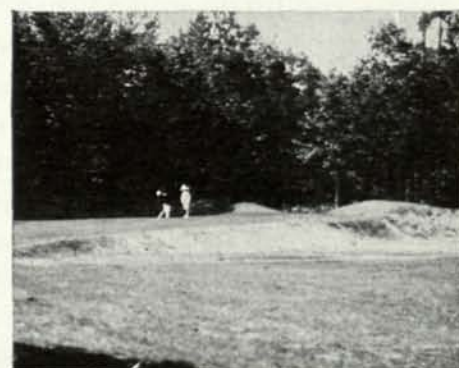
THE OCEAN-FOREST COUNTRY CLUB