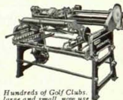
Hundreds of Golf Clubs, large and small, now use the Peerless Lawnmower Sharpener.

Special Grinding Wheel Attachment for sharpening grass shears, sickles, scythes, axes, etc. Skate Sharpener attachment sharpens all makes of skates—including hockey. Earns money all the year 'round. Will save its cost the first season. Write for Catalog and list of users.