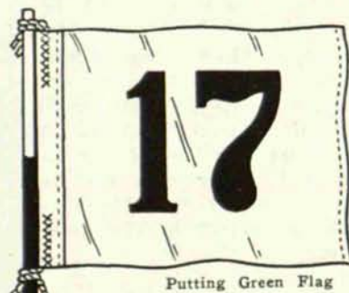
Putting Green Flag