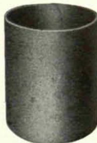
PETERSON'S HOLE CUP

Instead—two strong weatherproof cords are passed through and fastened to a sturdy canvas heading. (Note construction shown in accompanying cut.) Size of flags, 14" x 20", and furnished in the following color combinations, white and red, black on orange, black on yellow, green and white. Price, Set of 9, numbered 1 to 9.....$ 7.00 Price, Set of 18, numbered 1 to 18.....12.00 Price, Without Numbers, Each......60 Direction Flags—Yellow and black squares, Each......65 Made of finest quality all wool bunting.