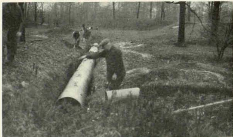
INSTALLING ARMCO PIPE AT THE CLEVELAND COUNTRY CLUB Photo shows Bert G. Sheldin, greenkeeper, helping lay a 30-inch pipe on No. 5 fairway. A minimum amount of excavation, quick placing and easy aligning are characteristics which speeded up the work

weather flow. No attempt was made to provide ample capacity for storm water, which was left to flow over the fairways. At the time it was thought that this plan would provide an economical and adequate