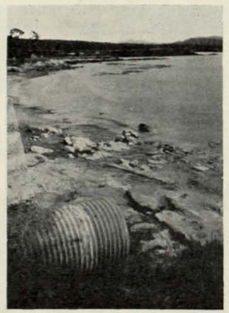
ARMCO AT PEBBLE BEACH Showing how an open ditch across No. 18 fairway was completely enclosed in an Armco Corrugated Iron Pipe

This course is located at Del Monte, Monterey County, California, on what is known as the seventeen-mile drive. It is numbered among the well known courses of the county and is famous both for its natural beauty and the number of notable tournaments which have taken place on it in the past.