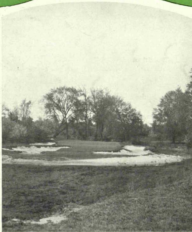
THE SHORT SEVENTH AT HAWTHORNE VALLEY

This spotty one-shot hole is located on the east course of this well-known Detroit daily fee lay-out