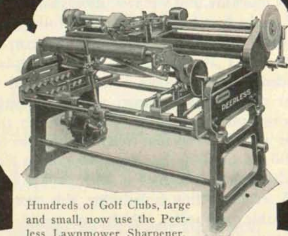
Hundreds of Golf Clubs, large and small, now use the Peerless Lawnmower Sharpener.