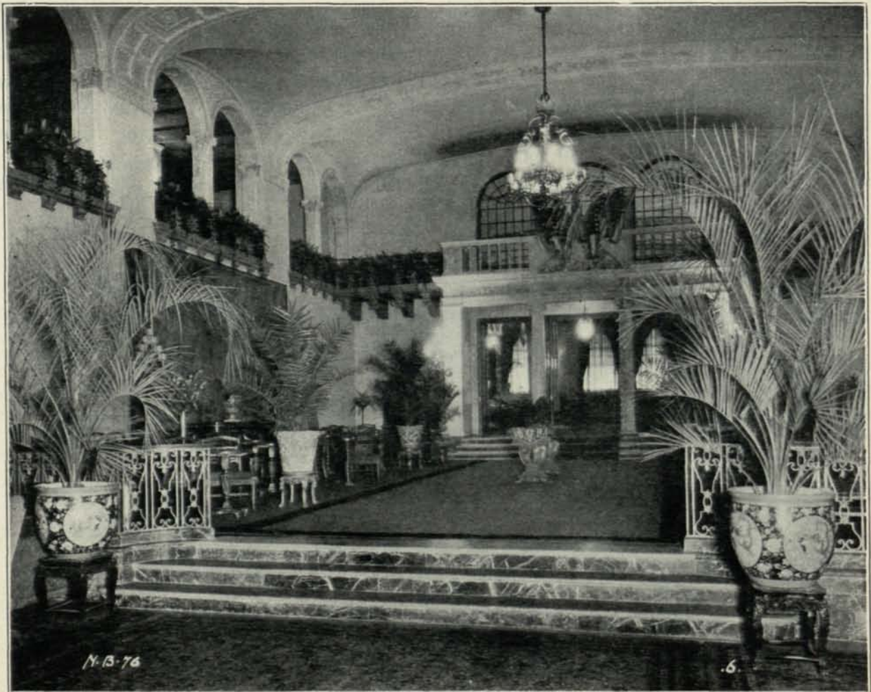
Lobby of the Beautiful Hotel Statler, Buffa'o, where the National Greenkeeper's Golf Show will be held February 13-16

OUR annual Golf Show in connection with our four day conference and convention will take place the second week in February, 1929. It will be held at one of the leading