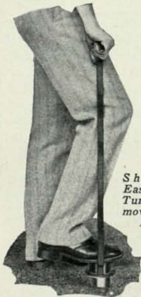
Showing How Easily the Sawco Turf Plugger Removes Weeds and Bare Spots

The Sawco Turf Plugger is operated by placing the plugger over the weed, ant-hill or bare patch, and pushing it gently into the turf with a slight pressure of the foot. In a sim-