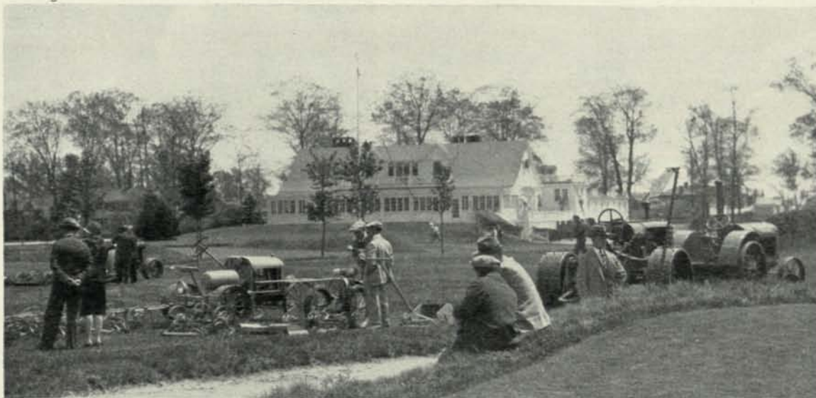
THE BEAUTIFUL ST. ALBANS GOLF CLUB ON LONG ISLAND In the foreground are the tractors ready to do their stuff

Manager, Metropolitan District Green Section