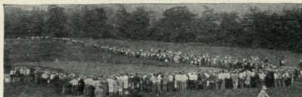
"Beautiful Turf from Tee to Green"

For further information address SEWERAGE COMMISSION 508 Market Street Milwaukee, Wis.