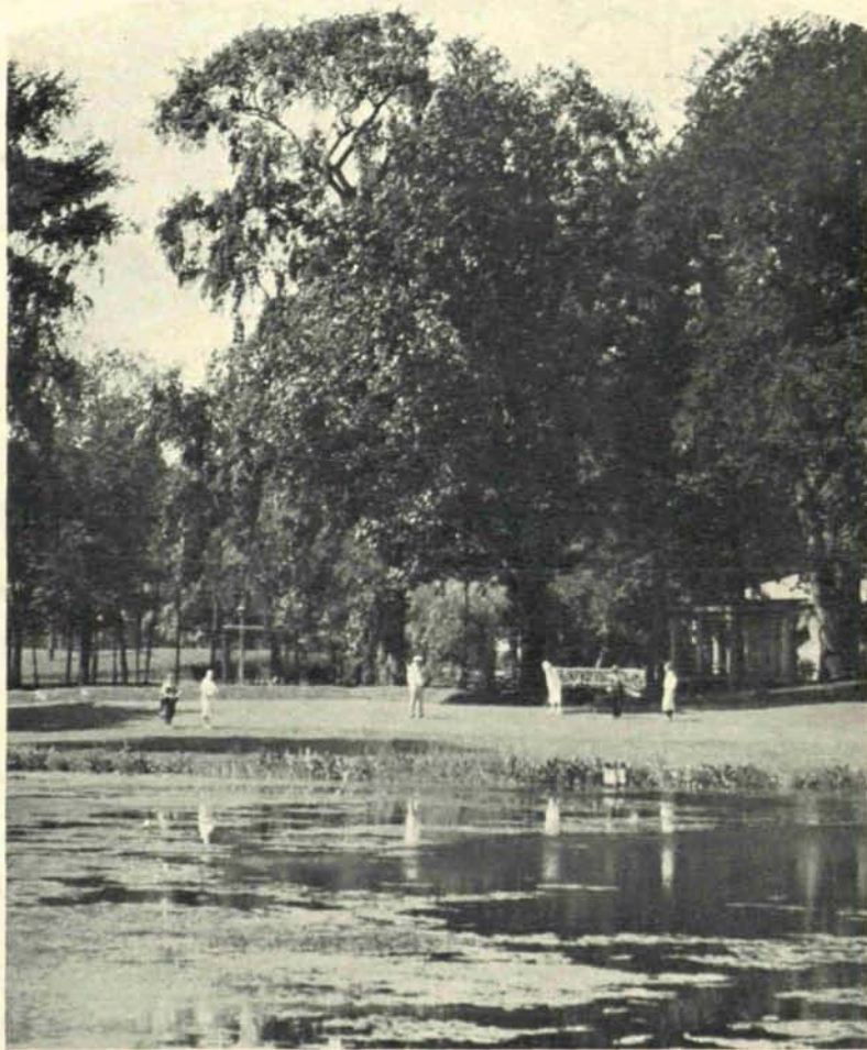
The Water Hole at Congress Lake Club Canton, Ohio