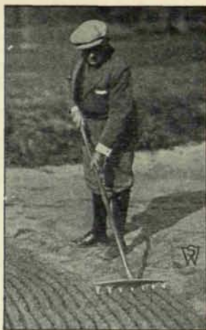
The George Low sand trap rake makes a fair lie

Southern greenkeepers in particular will be interested in the Sawco lawn cultivator rake, pictured herewith, as it is a valuable implement to use in renovating Bermuda greens