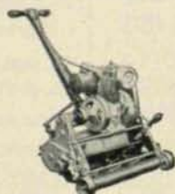
Jacobsen power putting green mower. New model cuts faster

T HE Jacobsen Manufacturing Company, Racine, Wisconsin, is speeding up production on their new 19-inch Power Putting Green Mower