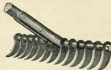
Sawco lawn cultivator rake. In use on many Southern courses in renovating Bermuda greens