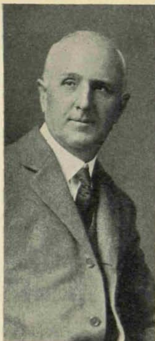
William C. Fownes, Jr.