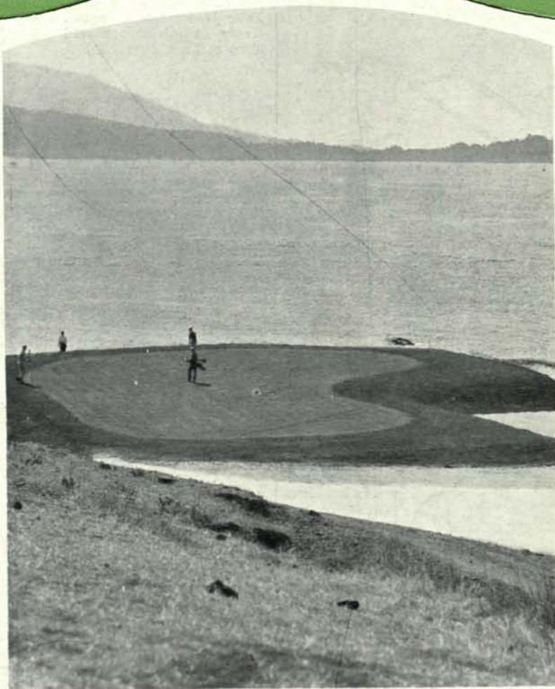
Scene on the Pebble Beach Course at Del Monte, Cal., where the National Amateur Championship will be held in 1929