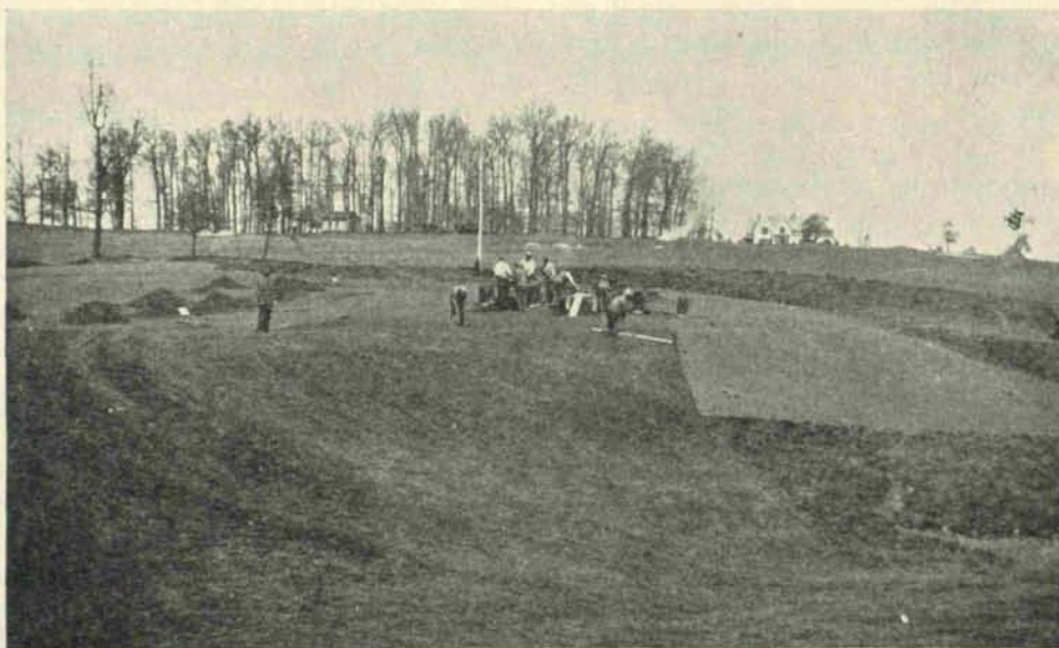
Sodding Greens at the Pittsburgh Field Club