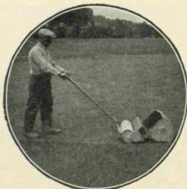
The Improved 1927 Model Super Roller Greens Mower.