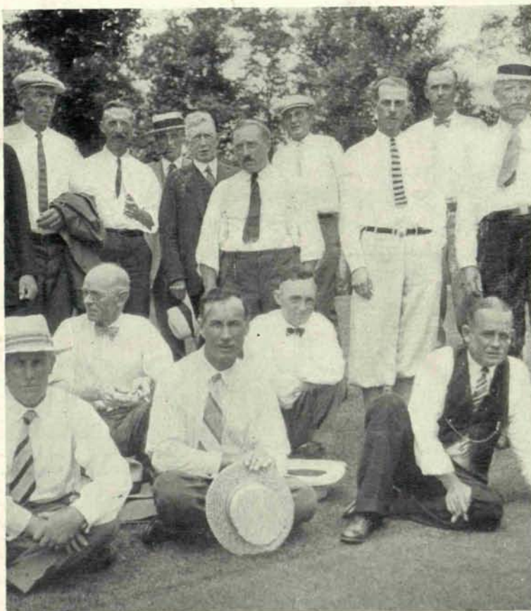
SOME OF THE MEMBERS OF THE MID-WEST GREENKEEPERS' ASSOCIATION TAKEN AT NORTHMOOR COUNTRY CLUB ON AUGUST 8