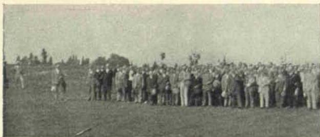
A group of the guests of the U. S. G. A. Green Section, taken at Indian Springs Country Club, on August 29

to allow those present to visit and inspect some of the district's fine courses.