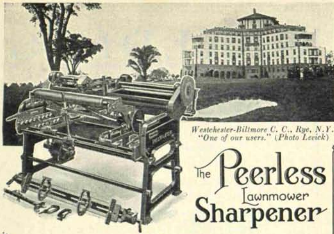
Westchester-Biltmore C. C., Rye, N.Y. "One of our users."