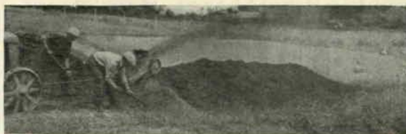
A Royer blending and shredding sand, soil and manure in one operation as fast as two men can shovel the material into the hopper

Cuts the time and expense of preparing top-soil, compost, etc., 75% to 85%