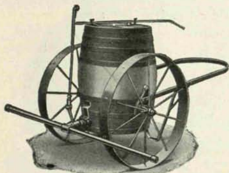
Barrel Spray with Handle Shut-off

THE exhibit of the J. Oliver Johnson Company of Chicago at the International Golf Show will be extensive, in fact will cover practically the entire list of equipment necessary for the maintenance of a course. A selection from this large number of pieces is pictured below.