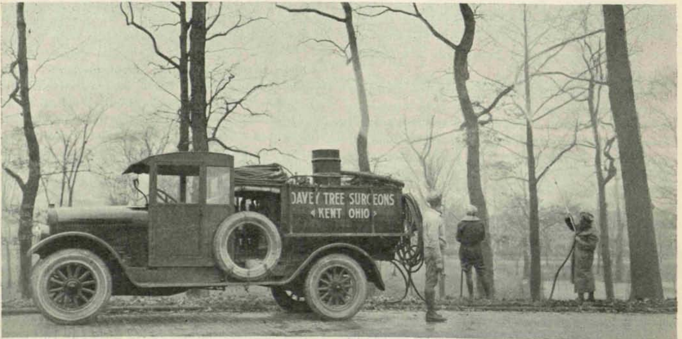
Large tank truck in use applying dormant spray before trees are in leaf. This equipment makes quick work of spraying trees on golf courses, public parks and large estates

Since many of the insect pests and fungous diseases