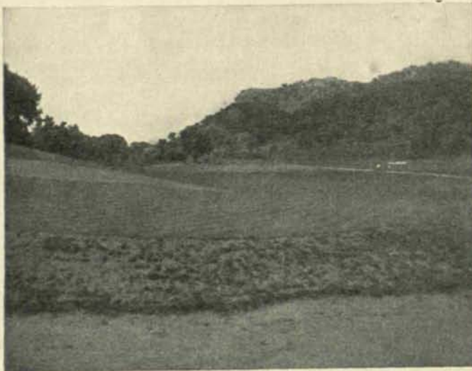
New Bent green Number 9 at LaCrosse Country Club seeded May 1, taken August 15, and open for play Sept. 1, 1927

Our greens are top dressed three times a year. The dirt is hauled by the greens the day before, and in this way it takes us about a day. We use a Toro top dresser. When we did it by hand it took us two days.