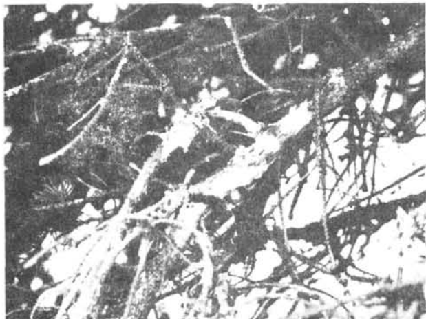
Figure 3. Close-up of a limb in a Blue Spruce infected with Cytospora canker showing the white resinous exudations.

Cytospora is most often found on older, less vigorous trees. Therefore, a fertilization program, such as