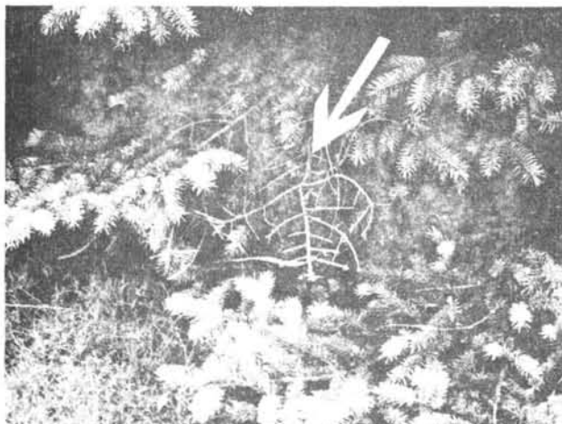
Figure 1. First symptom of Cytospora canker is the appearance of dead branches near the ground. (Arrow)

Browning and death of the branches near the ground are usually the first recognized symptoms (Figure 1). The disease generally progresses upward in the tree at a slow rate, often only one branch becomes infected each year. Many homeowners attribute this slow death of branches to other causes such as insects or excessive shading. It is only after many limbs have died, or when the branches die at the rate of several each year that an individual becomes concerned. Cytospora canker seldom kills a tree, but con-