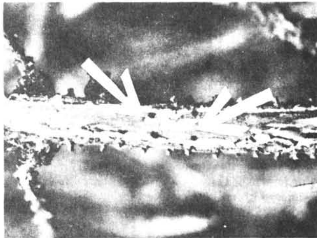
Figure 4. Limb with bark shaved, exposing the black fruiting bodies of the cytospora fungus.

As with most diseases, the best cure is prevention and early detection. Check spruce trees often, at the first symptoms of Cytospora canker prune out infected branches. This will reduce the probability of more extensive disease development.