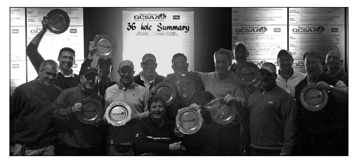
The MAAGCS fielded the most teams and took home the most hardware at the National Championship and Golf Classic in La Jolla.