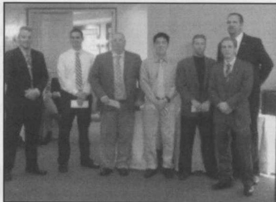
Six scholarships were awarded to UMD IAA students