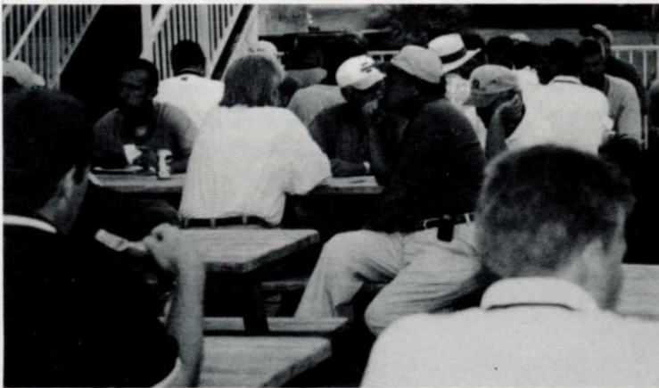
Tournament participants enjoy a delicious barbeque dinner

Ace Tree Movers Ault, Clark & Assoc. CEM, Inc. Century Rain Aid Egypt Farms Fisher & Son Flowtronex-PSI Geese Be Gone Holly Hills Country Club Jack Hewitt Co.