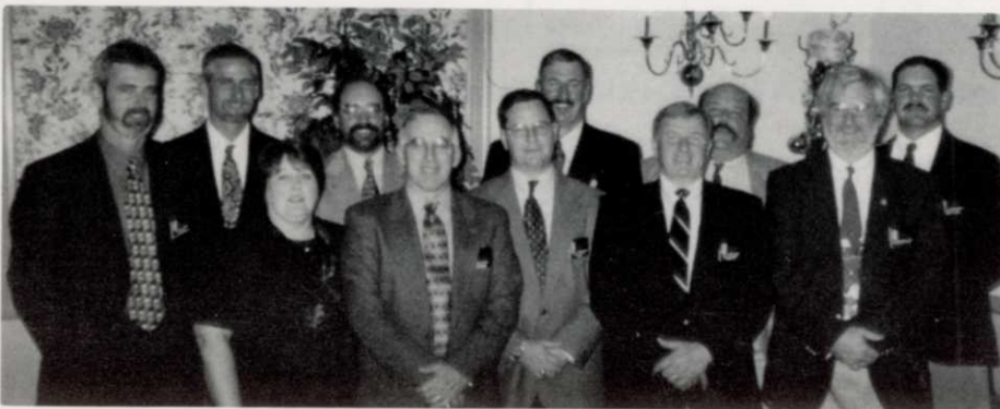
1999 MAAGCS Board of Directors

The new committee chairmen will be appointed at the January Board of Directors meeting. Please do not hesitate to serve when one of the Directors calls on you. MAAGCS will only be as good as the effort its members put into the association.