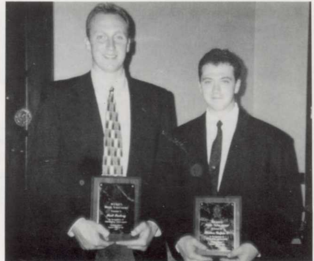
1998 MAAGCS Merit Scholarship Recipients