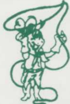
Al The Cricket