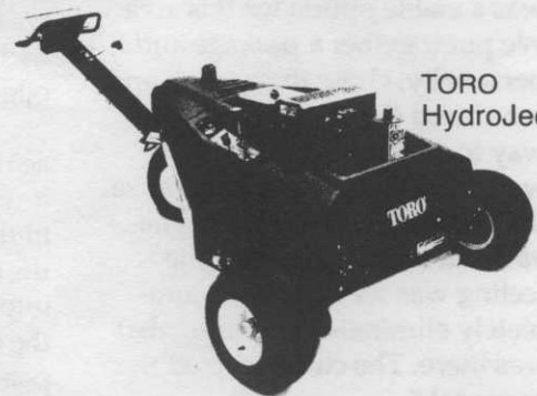
TORO HydroJect™ 3000

HydroJect™ your greens today to relieve compaction, eliminate localized dry spots and help them get through the dreaded summer season. Call for a demonstration.