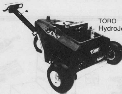
TORO HydroJect™ 3000

HydroJect™ your greens today to relieve compaction, eliminate localized dry spots and help them get through the dreaded summer season. Call for a demonstration.