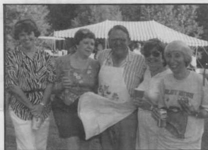
a great time was had by all