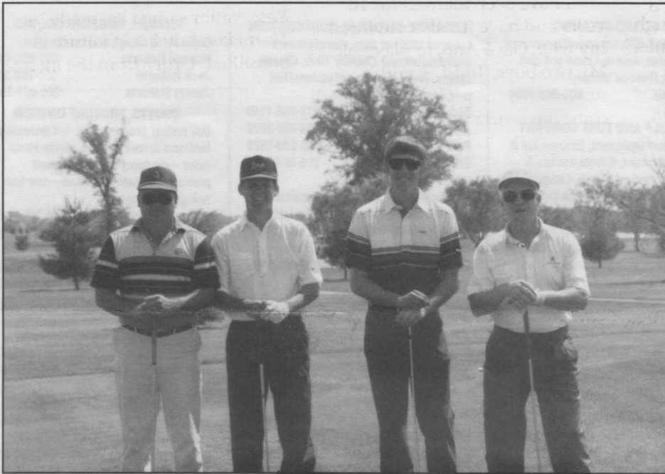
"The Blues Golfers" look forward to playing golf at Caroline Country Club on July 11.