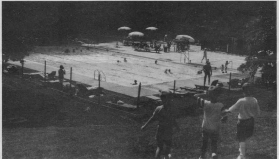
The Water was Great!