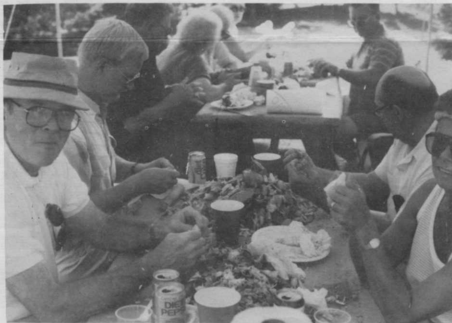
The Crabs Were So Good!