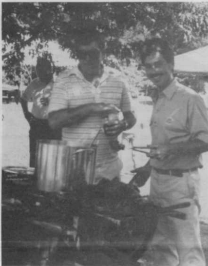
Our President and the Chef