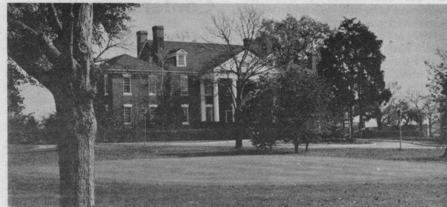
Fredericksburg Country Club

If the purpose of the MAAGCS and this newsletter is to aid our advancement through education and merit, we need to hear from you.