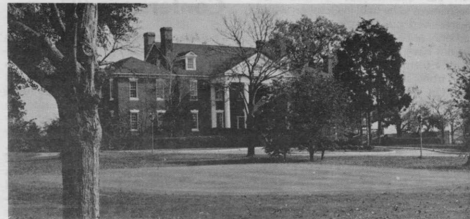
Fredericksburg Country Club

If the purpose of the MAAGCS and this newsletter is to aid our advancement through education and merit, we need to hear from you.