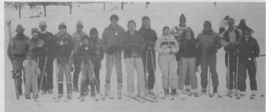
Fun in the snow at the Bryce Resort in Bayse, Virginia