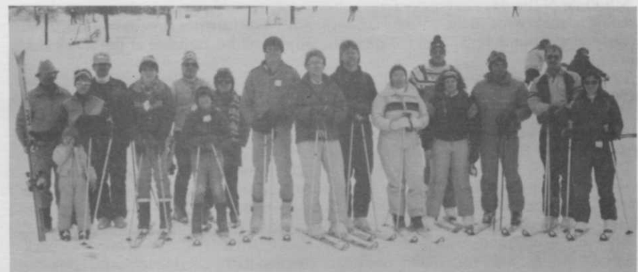
Fun in the snow at the Bryce Resort in Bayse, Virginia