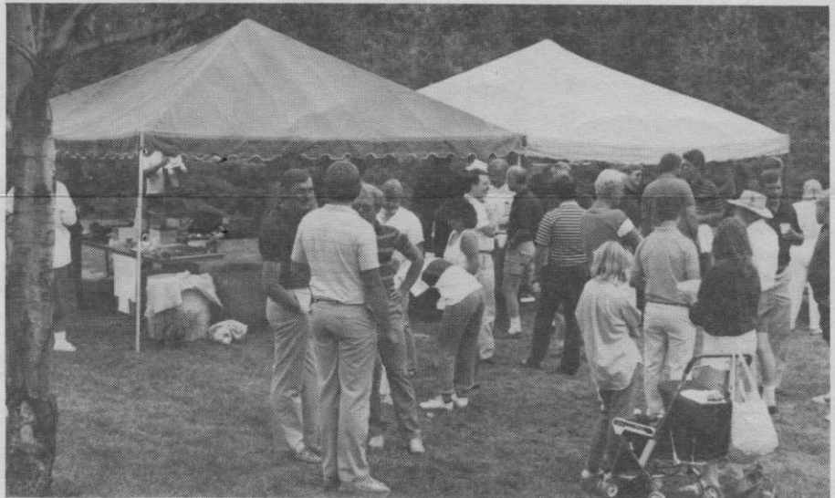
Cool weather - a welcome change from the heat at our last picnic - made the August 12 annual MAAGCS picnic a fun event for all, as everyone partook of hamburgers, hot dogs, steamed crabs, barbecued ribs, and fresh-picked white corn, not to mention a tent full of salads, desserts, and other goodies prepared by members' wives. More pictures of the crowds around the tents at Hobbit's Glen are on page 3.

Lunch - 11 a.m. on (snack bar) Golf - 11:30 - 1 p.m. (carts $12 for 2) Cocktails - 6:30 (cash bar) Dinner - 7:30 ($26.50) Meeting - 8:30 Reservations - Call 964-0070 by Sept. 4