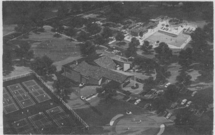
MARLTON COUNTRY CLUB

As you can see, the club complex includes tennis courts, a swimming pool, and an extensive club facility. The club currently operates privately except for daily tee play on the golf course. I hope to have a Meeting in the new building in Fall 1978 or early 1979.