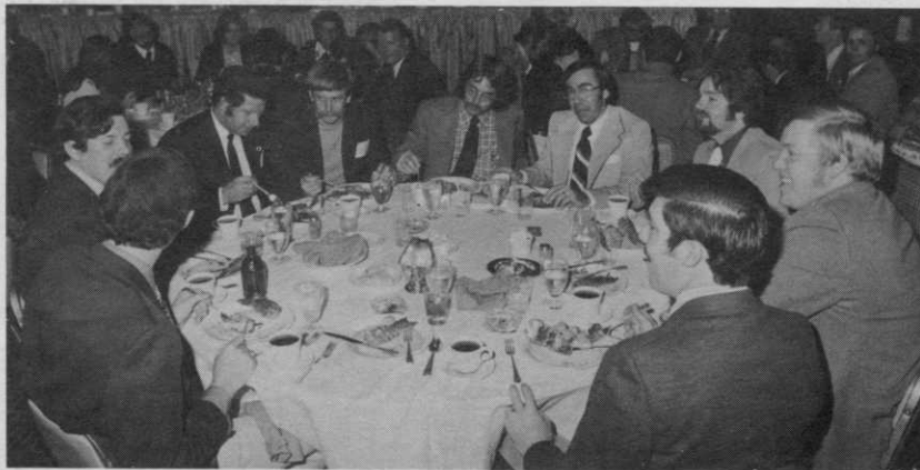
Dinner in the Carrollton Ballroom.