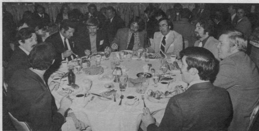
Dinner in the Carrollton Ballroom.