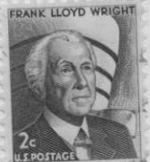
FRANK LLOYD WRIGHT