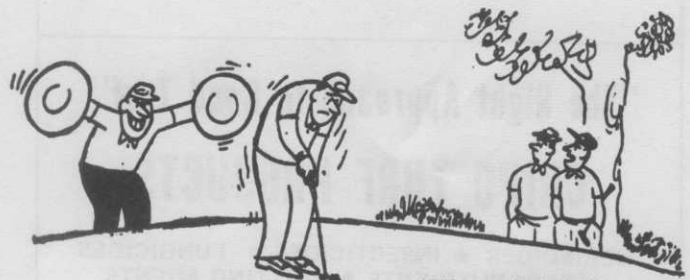
"His psychological game is pure murder."