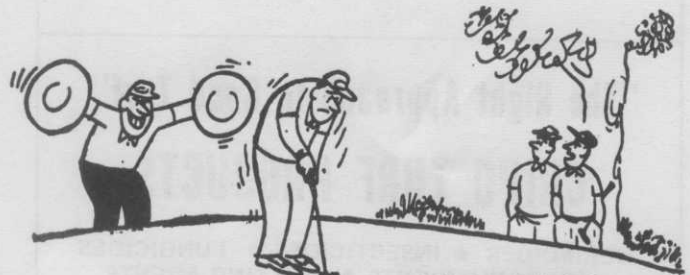
Cartoon from So. Cal. Newsletter