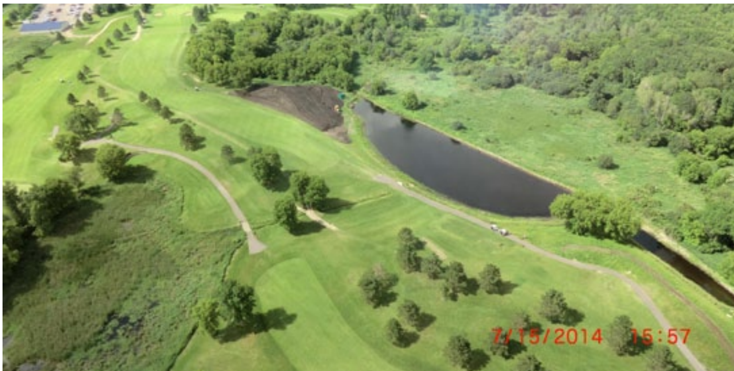
The newly created containment pond on Oneka Ridge Golf Course captures phosphorous laden water from urban and agricultural runoff.

Do you have a local source of reusable water for use on your course?