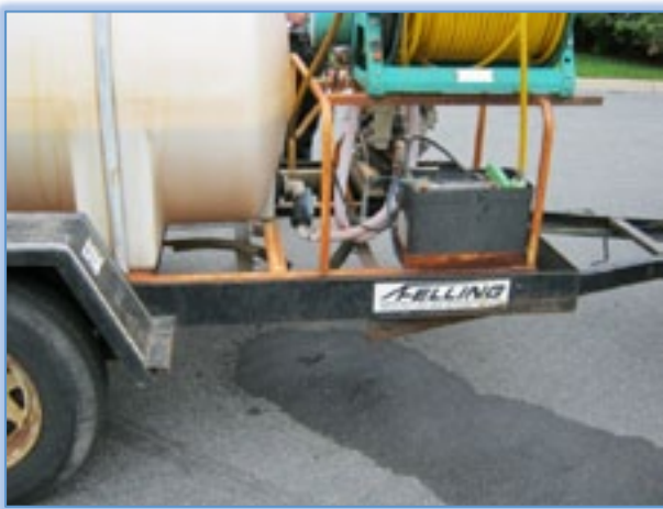
Leak from application equipment

An incident is an event where a threat or actual agricultural chemical spill may adversely impact the environment or threaten public safety.