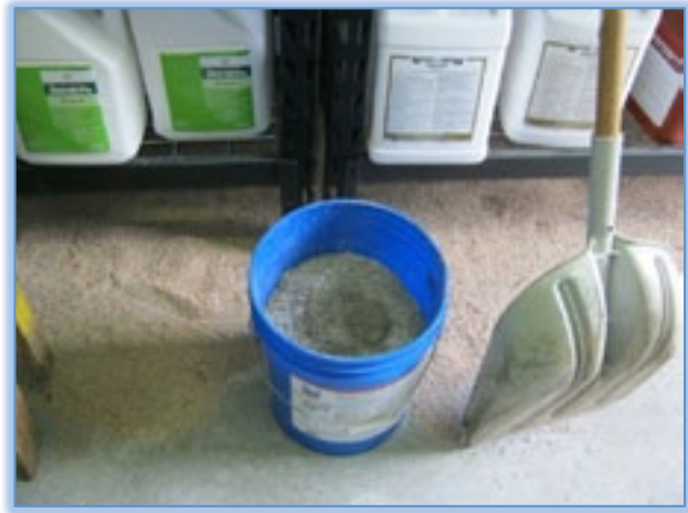
Spill in shop/storage area