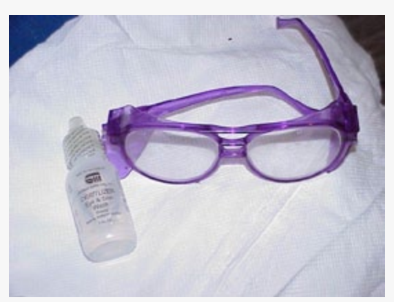
Safety glasses: Must include brow/temple protection.