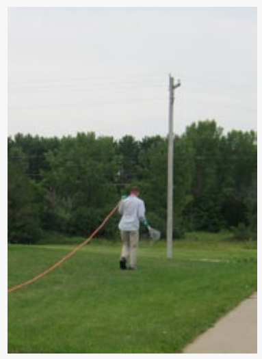
Meets all PPE requirements pants, long sleeves, safety glasses and gloves