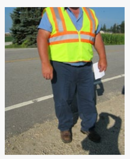
Violation: Missing gloves