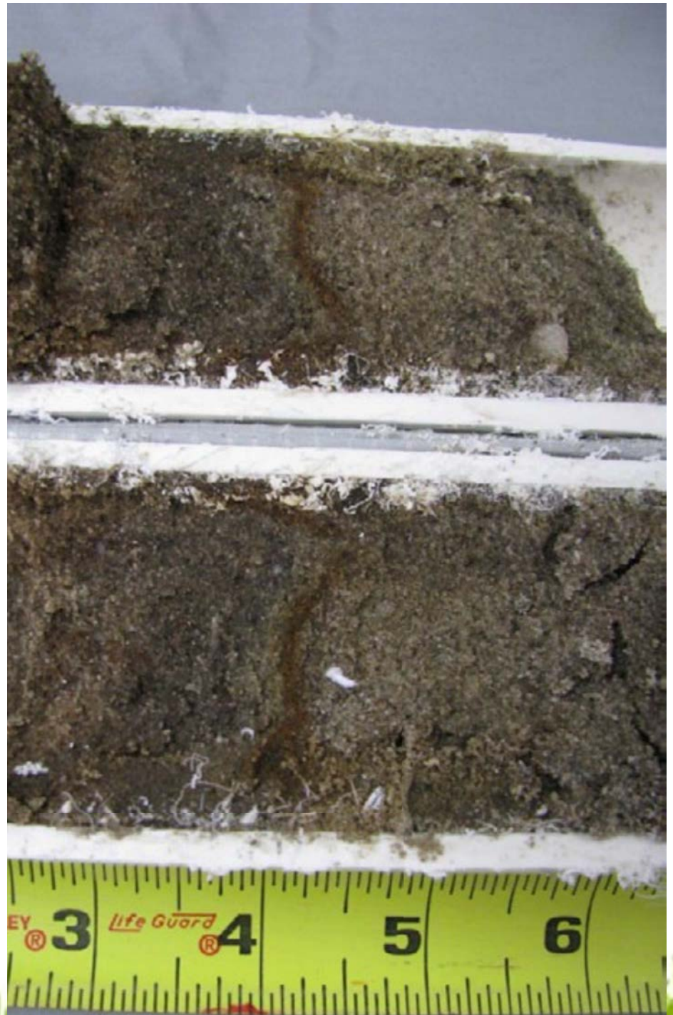
Figure 2. An iron layer is beginning to form at about four inches down because of textural discontinuity where fine topdressing sand sits on top of the original root zone mix.

some evidence of iron cementation at the pea gravel/sand interface. Glen selected five of the most developed iron layers for further study and found that the layers are indeed composed of iron and manganese oxides (Figure 1). The iron and manganese move down from the top layers of soil and horizontally from upslope areas. As a consequence, the iron layers are usually most severe at the lowest laying areas in putting greens.