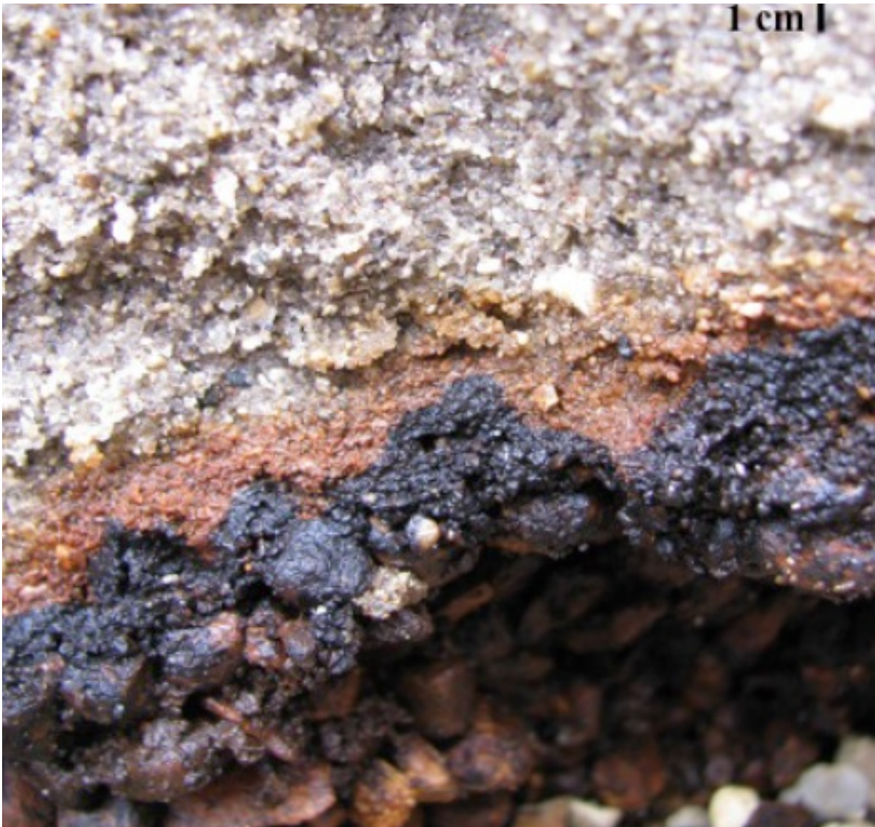
Figure 1. Red iron and black manganese accumulating at the pea gravel/sand interface of a USGA putting green.

At first, we figured this iron cementation was a rare problem that was specific to the tropics because the only other case that we knew of was from a club in Vietnam. However, after randomly sampling greens from all over the US, Glen estimates that 25% of all USGA greens will show