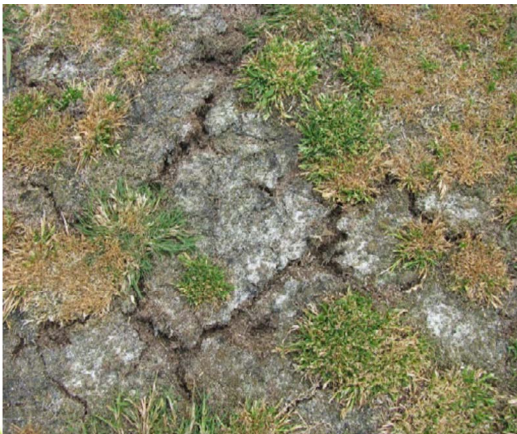
Figure 4. A white crust of calcium carbonate is starting to form on top of the algal mat. (Image: Obear)

However, we really don't know if the high pH soils with calcium carbonate build up had a problem with reduced pore space. So Glen designed a greenhouse study where he irrigated bentgrass with pure water (no bicarbonate) and water nearly saturated with bicarbonate. After about three years' worth of evapotranspiration and no drainage, he found a small amount of calcium carbonate build up, but no evidence for clogging of pores. In fact, the pure water was found to have a higher degree of clogged pores. The exact reason for this is unknown, but we think it may have something to do with the pure water causing the peat moss in the soil to expand to a greater extent than happens with the bicarbonate water.